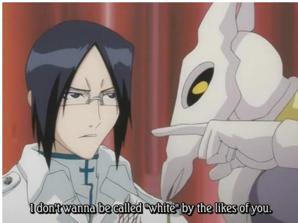
Uryuu Ishida in Las Noches

One interpretation of why kuudere characters are used can be seen as a balancing act between comedy and realism. An interesting interaction between serious and funny. The contrasting personality types highlight seemingly polarized personalities but I think that’s what brings out the best in both. The use of two characters with such different personalities allows for characters to not be defined by a plain type but allow for exploration of all of the inner workings of each character. The comic relief getting a laugh out of the kuudere is satisfying. This is best illustrated in the relationship between Raven and Beastboy from Teen Titans but also seen in Bleach with interactions between Nel’s friends and Uryuu when he was in Hueco Mundo.