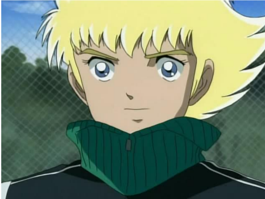
Karl Heinz Schneider

on the inside” kind of character. The history of this character is very hard to pin down but it seems that anime in the 90’s was where this character became more well known. Being shown in anime with Android 18 from DBZ, or Sailor Neptune from Sailor Moon. The earlier example I could find of this character type in anime, or manga, was Karl Heinz Schneider. This character was introduced in episode 98 of the Captain Tsubasa Anime that ran from 1983-1986. 3 If you guys have an example of an earlier character that fits this archetype please let me know in the comments below so I can change this history section if needed.