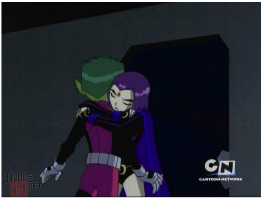
Beastboy and Raven from Teen Titans

Type 3 — Mood-Swinger: Alternating between 'kuu-' and 'dere' persona depending on their mood. What controls the mood? Some may have clearly defined hot buttons. Others might switch moods at what seems to be random moments, which can be very unnerving or confusing to those nearby. Some might contend that this version isn't 'kuu-' (cool) enough to qualify as a kuudere, and might place them in some other category. But for the sake of this breakdown of the kuudere, we will keep it in.